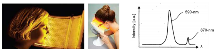
Figure 1: Picture of the GentleWaves® Low-Level-Light-Based-Device, its updated version, and their spectrum of emission (cfr. EP2912509B1, EP2861203B1).

LLLBD: GentleWaves® LEDs-based device emitting specifically pulsed light at 590 nm as predominant wavelength and 870 nm as secondary wavelength. Each application consisted of daily exposure of 0.1 J/cm 2 , during 70 s.