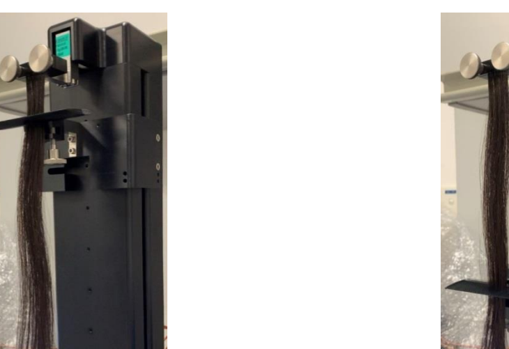
Figure 2. Combing evaluation performed by miniature tensile tester

Encouragingly, our solid shampoo bar formulation has a high ingredient tolerance. For example, we have successfully incorporated the extract from magnolia officinalis, a traditional Chinese medicinal plant, into our formulation. The major active substances in the extract are Magnolol and Honokiol (Figure 4), which have been demonstrated to possess anti-inflammatory, anti-oxidation, anti-bacterial and anti-angiogenesis functions [4,5].