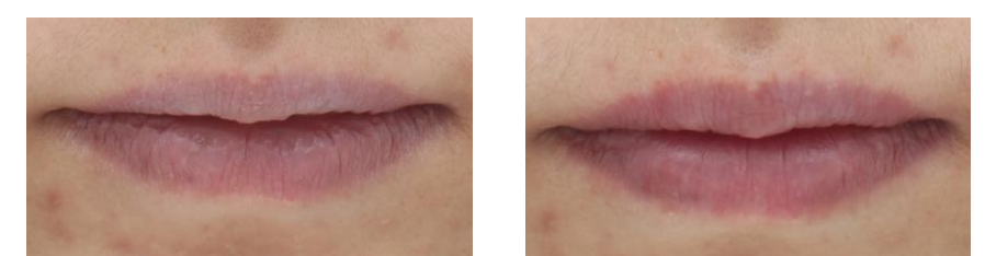
Figure 1 Typical case 1 Comparison before and after operation