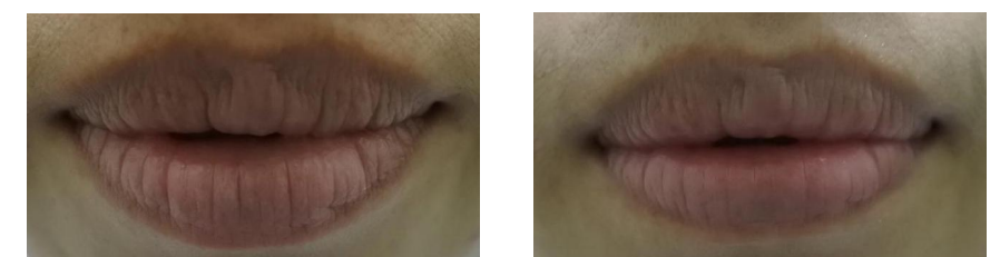
Figure 2 Typical case 2 Comparison before and after operation